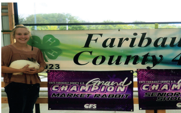
Faribault Co. 4H