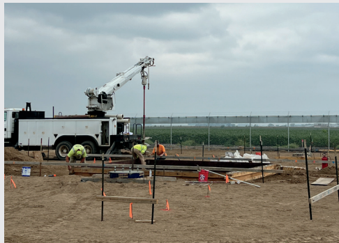
Broken ground and construction of new substation.

This substation dates back to the early 1960s. A new substation for the area will add necessary capacity, reliability, sustainability and new technologies. This will help better serve the northern most part of