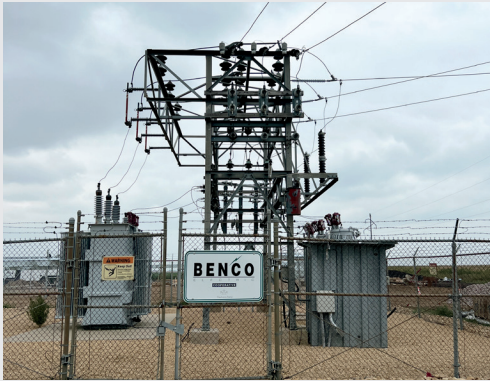
Existing substation dating back to the 1960s.

Last month BENCO broke ground to begin construction of a new Rush River substation. Our Rush River substation serves approximately 815 members and is located in Prairie Lake township. The substation is south of Nicollet County Road 8.