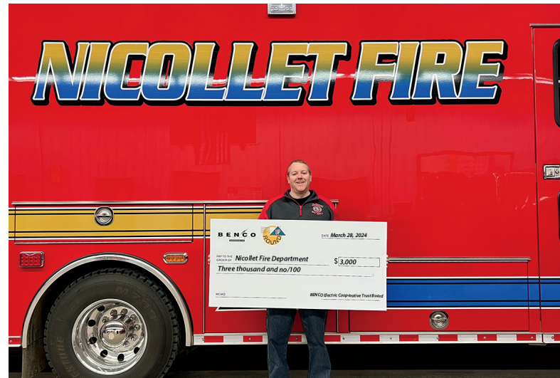
The Nicollet Fire Department will use funds granted in March toward Particulate Blocking Hoods (hoods used under firefighters' helmets to protect their heads and necks from heat and smoke).

Communities Partners (FOCP), Maple River Robotics, Connections Shelter, Minnesota Warrior Ice Hockey - Mankato, MN Brain Injury Force, Habitat for Humanity of South Central MN, Nicollet Fire Department, Winnebago Ambulance, Echo Food Shelf, Faribault County Food Shelf, Janesville Food Shelf, Kiester Food Shelf, Lake Crystal Area Food Shelf, Maple River Loaves and Fishes Food Shelf, St. Peter Food Shelf, Wells Area Food Shelf and the Winnebago Food Shelf.